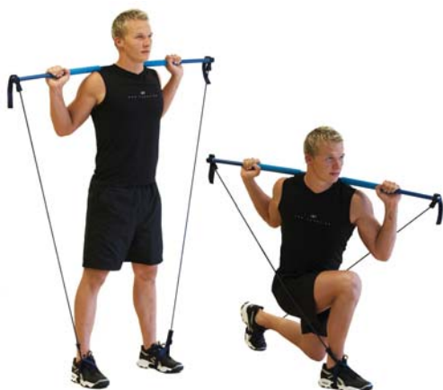
Lunge with body rotation