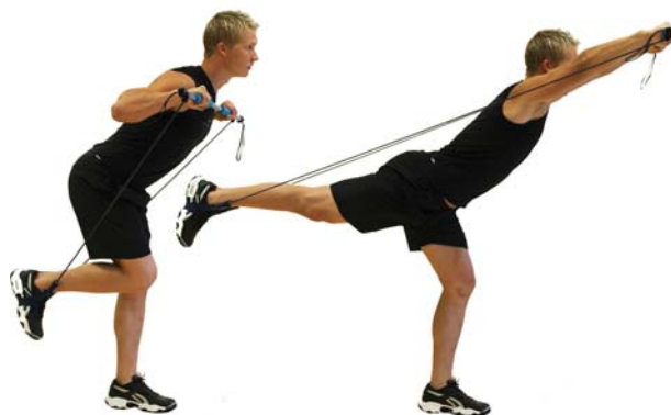
Press forward and leg press ( Both loops in the back foot )