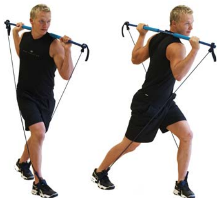
Cross country skiing jumps with body rotation