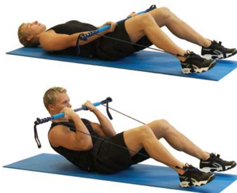
Crunch or Sit-up with biceps curl