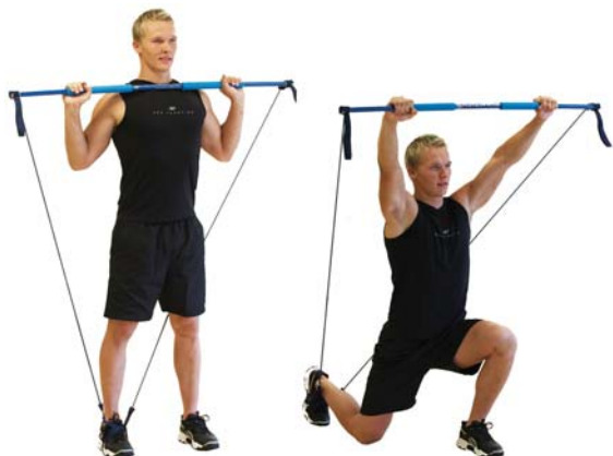
Lunge with a press ( both loops in the back foot )